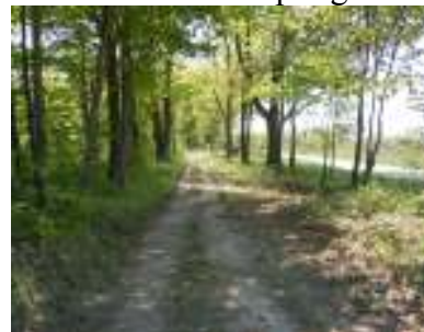
New Walk/Bike Path No Golf Carts on this Path!

Lead Testing has changed for us here at Quinte's Isle Campark due to our consistently low or almost non-existent lead levels in the water. We do not test for 3 years and it is no longer done in anyone's personal trailers. Thanks to all of you that used to let Tammy into your units to do the sampling.